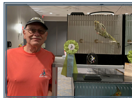
BABY SHOW WINNER