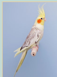
2022 Double Points Show Winner

Placed in all 3 shows at the 2022 NCS Specialty. Made Champion status at 8.5 months old!