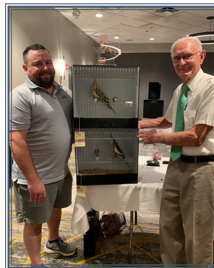
SPECIALTY SHOW WINNER