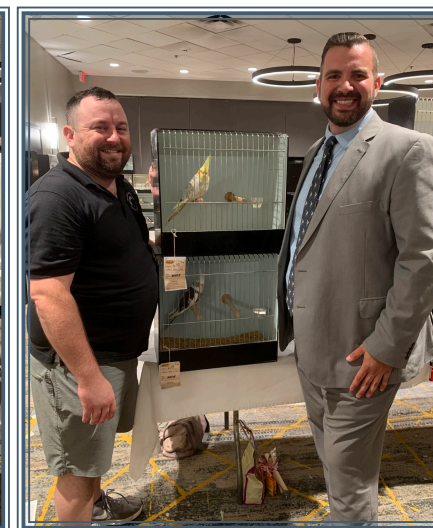
DOUBLE POINTS SHOW WINNER